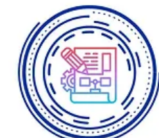
STRATEGIC PLANNING & VISIONING